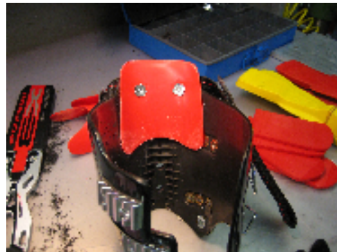
Attached shortened spoiler