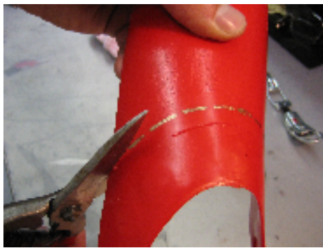
A Marked spoiler that is being cut down.